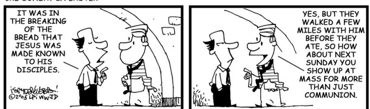
3RD SUNDAY IN EASTER